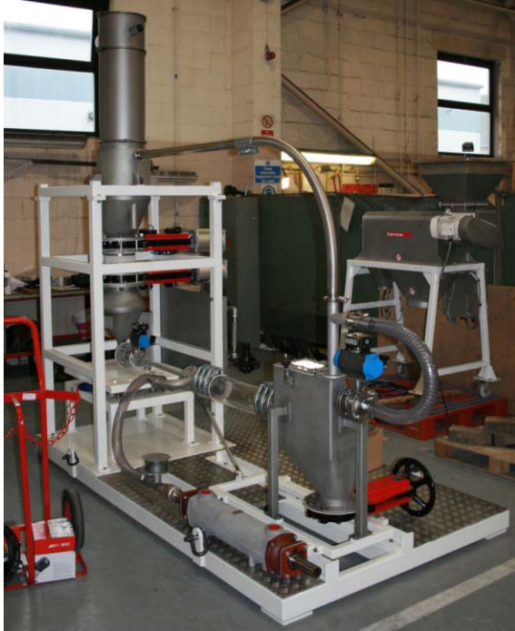
Figure 6: Commissioning of the new powder rig.

designed and commissioned to understand and optimise the parameters affecting the powder jet and the performance of the main recirculation system. In order to validate the technology, the rig will be used to evaluate the life time and long term reliability of the components. Since erosion is strongly related to the characteristics of the conveyed material, the rig will be used to evaluate different target materials, including some potentially less abrasive than tungsten powder, e.g. graphite and different geometries of the interaction area.