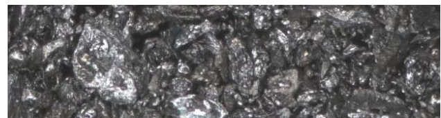
Figure 1: Micrograph of the tungsten powder used for the experiments.

The experiments were performed using a batch of tungsten powder of 60 mesh (i.e. of grains smaller than 250\mu\text{m} ) having resting bulk density of 8600\text{ kg/m}^3 .