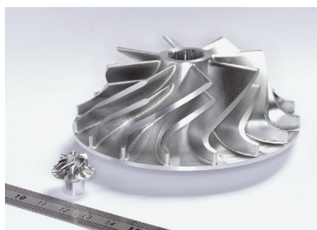
Figure 2: Examples of 3D wheels for few hundred watts and few hundred Kwatts turbines.

under real cold conditions. These good results, in addition to the optimisation resulting from the choice of operating mode, also contributed to the improvement of the performances (as shown in Table 1).