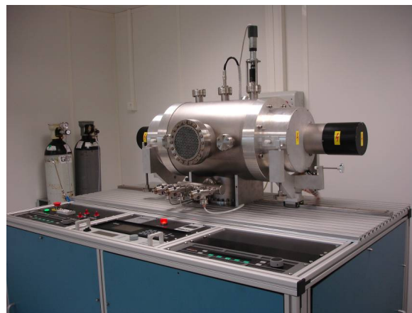
Figure 1: Magnetron sputtering system overview.

The technology chosen for TiN coating of RF ceramic windows is the reactive DC magnetron sputtering. For this purpose, a sputtering bench has been developed with the collaboration of the consortium Ferrara Ricerche-Italie in the frame of CARE program.