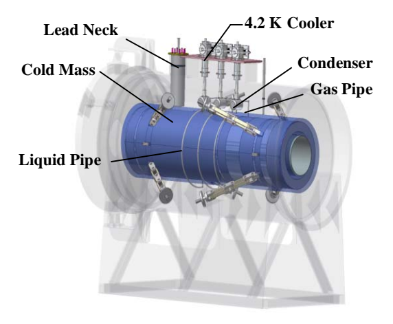
Figure 2: Magnet Cold Mass and Cryostat

Table 2 shows the estimated heat leak into the tracker magnet cryostat. The heat leak into the 50 K region and the 4 K region is dominated by the heat coming down the magnet current leads. The tension band supports represent the second largest heat leak into the 4 K region. At 50 K the second largest heat leak is thermal radiation through the MLI. The total heat leak at 4 K and 55 K suggests that the each tracker magnet can be cooled using two 1.5 W (at 4.2 K) coolers [7]. A third cooler is shown in Fig. 2, but this appears to be unnecessary.