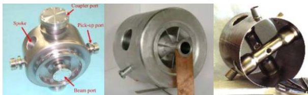
Figure 3. Spoke resonators: LANL ( \beta=0.2 ), IPNO ( \beta=0.35 ), and ANL double Spoke ( \beta=0.4 ).

[40] and LANL [41]. They could reach very high gradient and have demonstrated excellent mechanical stability. Spoke cavities with bore diameter up to 60 mm have been successfully built, making this cavity type one of the best candidates for all-superconductive, high power proton accelerators (HPPA).