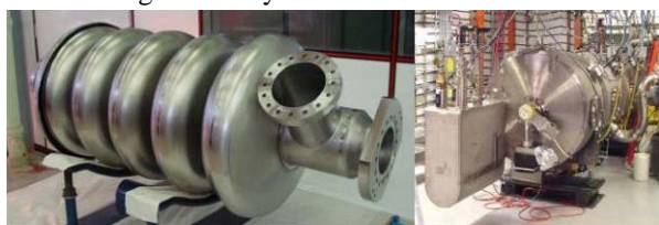
Figure 6. The 5-cell, \beta_0=0.65 CEA/CNRS cavity and the SNS cryomodule.

Pulsed vs. CW - CW operation is ideal for SC structures; NC resonators prefer low duty cycle, pulsed operation. Pulsed operation causes time dependent Lorenz force detuning, which makes difficult to keep high-Q, SC cavities locked to a fixed frequency (this, however, can be managed by means of fast tuning systems). This is not an issue for NC cavities with much lower Q. SC structures can operate at high gradient without problems of cooling; NC ones are limited in maximum operating gradient by water cooling efficiency.