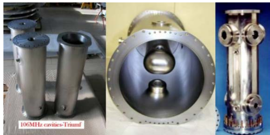
Figure 1. The 106 MHz TRIUMF-ISAC II QWRs, the 161 MHz QWR with steering correction developed by MSU and LNL, and the 97 MHz QWR at NSC.

beam emittance growth [19]. Above approximately 160 MHz, the best dipole compensation can be obtained with the more symmetric HWR shape. Cancellation of dipole and quadrupole field components is particularly important in high current proton-deuteron accelerators with space charge, like SARAF [20]. Here, 176 MHz HWR cavities with \beta_0=0.09 (fig.5) and 0.15 are under testing, similar to the ones proposed by ANL for RIA [13].