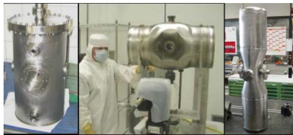
Figure 5. Coaxial HWRs from LNL-SPES (352 MHz), MSU-RIA (322 MHz) and ACCEL-SARAF (176 MHz).

Coaxial 2-gap HWRs have been built with \beta_0 up to about \sim 0.3 (thus efficient up to about \beta=0.5+0.6 ). More compact than 2-gap Spoke cavities, they have usually lower shunt impedance but they can be more cost effective and mechanically stable, with comparable performance. A 322 MHz, \beta_0=0.28 HWR has been recently built and tested at MSU for RIA [31], and a 352 MHz, \beta_0=0.3 one at LNL for the project SPES [29].