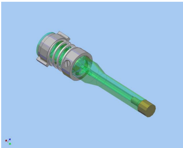
Figure 3: Photocathode design for the SRF gun.