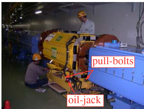
Figure 5: Vertical alignment is assisted by oil-jacks for the quadrupole magnets.

quadrupole magnets are adjusted by pull-bolt mechanisms for the horizontal alignment. Oil-jacks are used to assist the vertical alignment as shown in Fig 5. The sextupole mag-