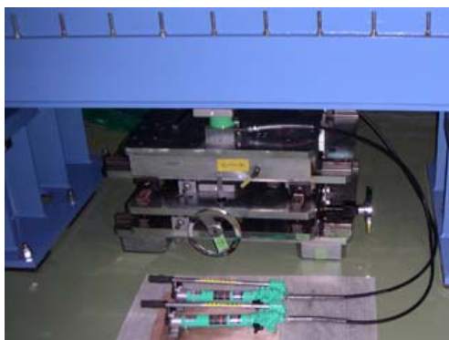
Figure 4: Alignment stage for the bending magnets consists of the two x-y stages and oil-jacks.

time by using the LT measurement system. People can adjust the magnet position directly watching the values. The