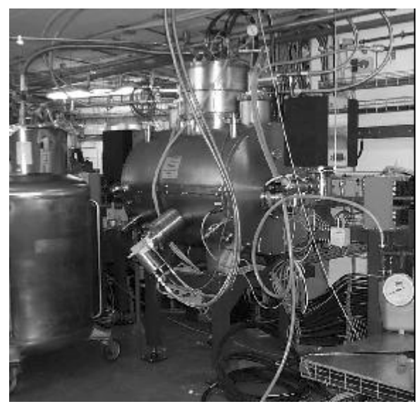
Fig.3: View of BAM-WLS on BESSY-II storage ring

The superconducting magnets are inserted into a special liquid helium cryostat. In the first cryostat for PLS-WLS with liquid helium consumption of 3 liter per hour there was only one cooper thermal screen cooled by liquid nitrogen. A whole series of improvements was carried out for reduction of liquid helium consumption. The view of another cryostat for BESSY-WLS where heat inleakage into the helium vessel from outside is minimized is shown in Fig.3.