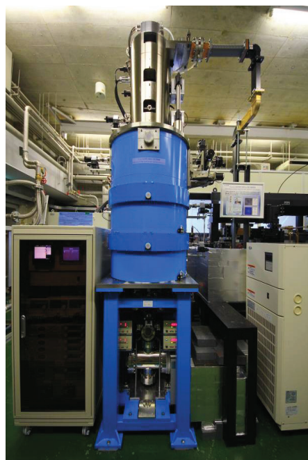
Figure 1: Prototype of femtosecond time-resolved relativistic-energy electron microscopy using RF gun.