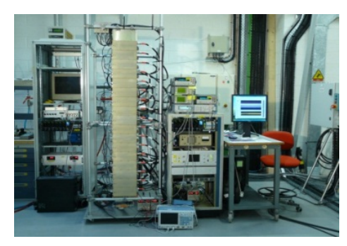
Figure 2: 500 MHz 10 kW unit prototype under long-term test at SOLEIL.

CW SSA is being built and will be tested on a dummy load, by the end of 2014 at SOLEIL.