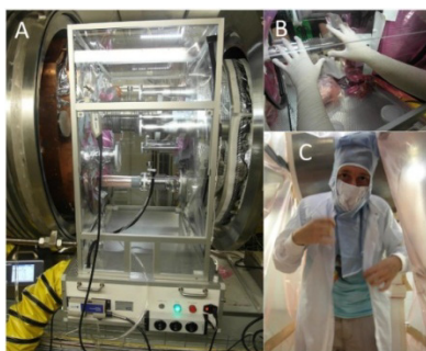
Figure 3: New clean for beamline connection at the AMTF hall.

At the AMTF test benches process of venting those devices now is performed directly through beamline of Feed-cap and End-cap devices. At the CMTB additional pump station with mass spectrometer and Dewar with liquid nitrogen has been required to perform this step. It is worth to mention that at the AMTF hall Dewar with liquid nitrogen for venting of UHV components has been replaced by flooding device. This flooding device uses nitrogen provided directly from line, manovacuometer and sets of filters. New software solution has been also implemented to control of the vacuum systems at the AMTF hall. Now control panels can be made directly by the user, which is more convenient and efficient in case of necessity of quick access to vacuum control systems.