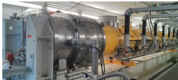
Figure 1: The accelerating cryomodule in the XATB3.

Considering the XATB design, the preparation of the accelerating cryomodule for the measurement is simplified and less time consuming than in the CMTB.