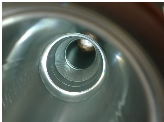
Figure 3: NEG coating of second series chamber with new surface treatments.

Figure 3 shows the NEG coating on the second set of chambers after implementation of the new etching and cleaning methods as mentioned above. Peel-off is not observed, and a constant surface finish can be seen.