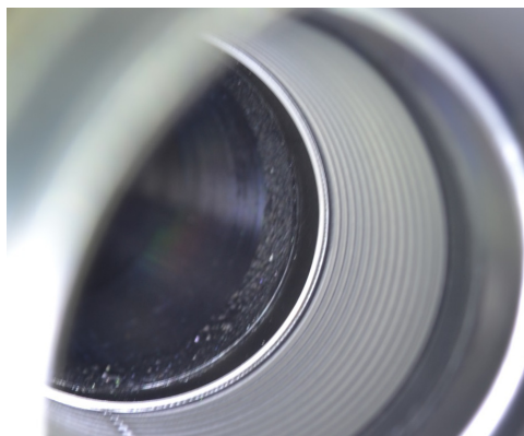
Figure 1: Peel-off.

Adhesion was also good for most of the chambers, being the VA type the only exception. For the three VA chambers treated, in independent runs, peel-off was observed at exactly the same place: after a weld between bellows and a short sleeve, around 2 cm in length, and on the flanges to a lesser extent. The outcome from an optical inspection with an endoscope (see Figure 1) has supported evidence for variation of the mechanical inner surface texture in the sleeve that coincides with the peel-off area. X-ray photoelectron spectroscopy was used to analyse the back of the coating that was in contact with the aluminium surface but no relevant contamination was found that could explain the poor adhesion. Since no wet chemical etching could be applied in order to remove the NEG in the whole chamber, due to the risk of trapping corrosion active elements in the bellow, the coating on the zones with peel-off was removed mechanically. The chamber was then bombarded with Krypton ions at approximately 400 eV at a dose of 2.8 \times 10^{-3} C/mm 2 , and then recoated with NEG without air exposure in between. The peel-off persisted, indicating the origin of the problem is not related with last layers of the aluminium surface. Since both the short sleeve and the flanges have the same turned mechanical surface finish, and the other parts are honed, except the bellow, we suspect this surface finish may be linked to the lack of adhesion.