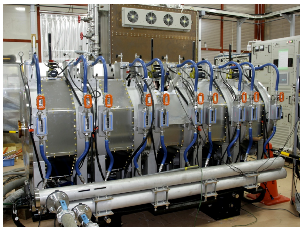
Figure 3: FT3L 5-GAP Cavity at the RF High Power Area.

Longitudinal manipulation is necessary to alleviate the space charge effect or to keep the stability criterion for longitudinal microwave instability. A 2 nd harmonic system is effective to make fast bunch lengthening during the injection period. The dedicated 2 nd harmonic system with air-cooled FT3L cores is designed. We made the single cell proto-type cavity to verify the technical issues [4].