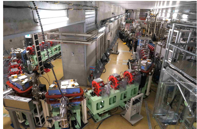
Figure 2: cERL constructed in the accelerator room.

The constructed cERL is shown in Fig. 2.