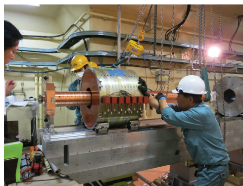
Figure 3: LAS structure insertion into DC solenoid.

We use the large aperture S-band (LAS) accelerating structures in the positron capture section since their aperture diameter (30 mm) enlarge the transverse phase space acceptance twice compared to that with the conventional S-band structures (21 mm). Details of the LAS structure is described in Ref [6]. In the capture section for SuperKEKB, six LAS structures are installed inside the DC solenoid modules as shown in Fig. 3.