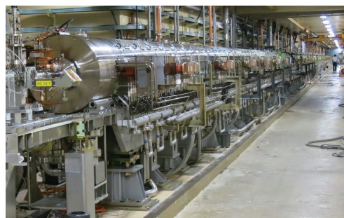
Figure 1: SuperKEKB positron capture section.

components and a preliminary positron beam performance are described in the following sections.