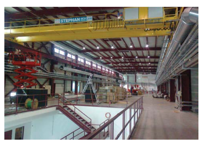
Figure 2: Infrastructure installation (Summer 2011).

Infrastructure is presently being installed (electricity, cooling and ventilation, cabling...) (Fig. 2). At the end of this phase, in June 2012, the installation of the accelerator components will begin.