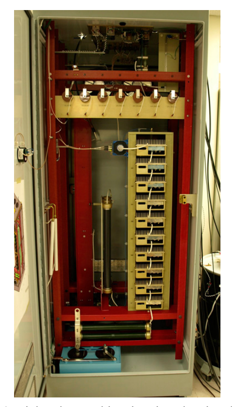
Figure 4: High voltage cabinet interior, showing the solid state switch (R), consisting of ten 3.3 kV switch modules connected in series.

Figure 3: The control rack and high voltage cabinet of the tetrode test stand.