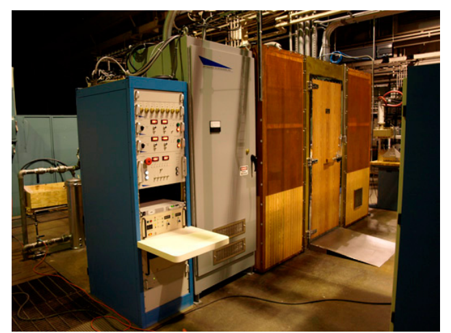
Figure 1: Tetrode Test Stand installed at Burle Industries. 07 Accelerator Technology T16 Pulsed Power Technology

Diversified Technologies, Inc. (DTI) designed, built, and delivered a 500 kW DC solid-state test stand for this conditioning and testing process to Burle Industries in Lancaster, Pennsylvania (Figure 1). This system is primarily focused on testing of high power tetrodes, and