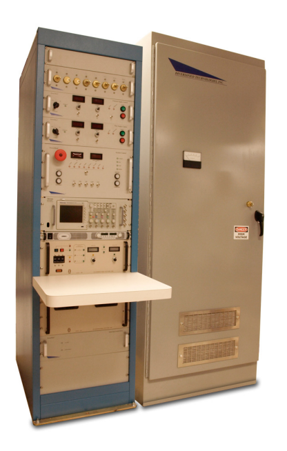
Figure 3: The control rack and high voltage cabinet of the tetrode test stand.