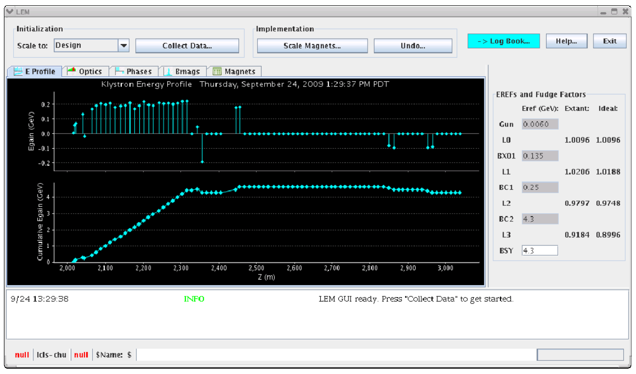
Figure 2: LEM Application screen snapshot. The plots shown are klystron energy gain (top) and energy profile along the LCLS linac.

three tabs of the LEM GUI, reformatted as one single panel. This application is running continuously and updates its display periodically. The same display panel is also packaged as a callable module so that other applications can use it. Examples of users are the Save/Restore system, and a script used to implement changes in beam energy.