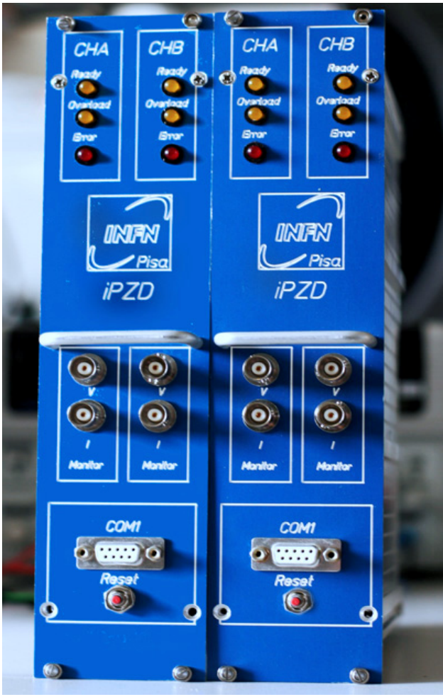
Figure 4: Two iPZD Modules. Com port is used to program the Digital Signal Controller.