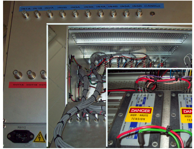
Figure 2: Piezo Control Unit back panel and insight view evidencing cabling and high voltage dc-dc converters