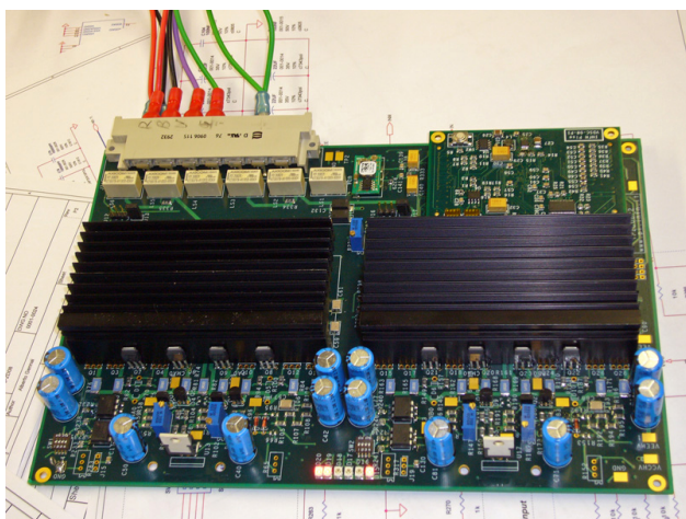
Figure 3: iPZD Module. Each module drives two independent channels.

Each of the five iPZD modules is hosted in a shielded plug-in module (6U, 12HP, Depth 167mm).