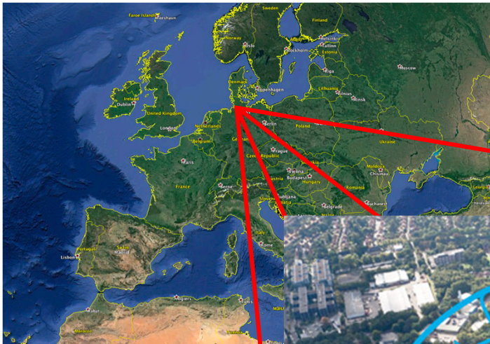
Location: Hamburg / Germany