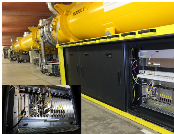
Figure 1: Installation of MicroTCA crates inside the FLASH tunnel underneath the accelerator module. The radiation shielding (yellow cabinet) protects the electronic rack inside. The insert shows the MicroTCA crate installed in this rack.

requires a compact system with implied redundancy. Further remote access to status information, software upgrades and maintenance is ensured. Finally the modularity and scalability of this system guarantees to have later upgrades in order to meet demands within a lifetime of the machine and beyond. DESY currently is operating the Free Electron Laser (FLASH), which is a user facility of the same type as E-XFEL but at a significantly lower maximum electron energy of 1.2 GeV. The LLRF system for FLASH is equal to the one of E-XFEL, which allows for testing, developing and performance benchmarking in advance of the E-XFEL commissioning [3]. A picture of the FLASH installation can be found in Fig. 1.