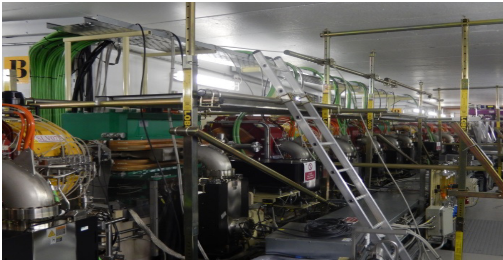
Figure 2: Temporary cable installation.

network in early 2015, and the addition PSUs will be added in early 2016, but again final testing will only be possible in installation shutdown and as part of commissioning with beam. The TMBF should have limited lattice dependence but will need recommissioning.