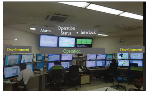
Figure 1: Photograph of the KEK electron/positron injector linac main control room.

The Tektronix X terminals and touch panel displays based on PC9801/DOS machines have been originally utilized as the operator terminals. These terminals were replaced by the Linux based PCs and Windows based PCs with the X server application software of ASTEC-X and